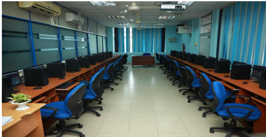
E-Library of PGIM is now open

For more information visit: https://library.pgim.cmb.ac.lk/ OR Email: library@pgim.cmb.ac.lk