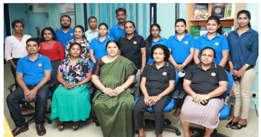
Staff of the Library, PGIM